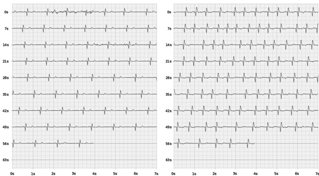
Figure 3 Electrocardiogram tracings recorded by the MyDiagnostick. Left: normal sinus rhythm. Right: AF.

The MyDiagnostick enabled rapid acquisition and analysis of 1 min long segments of ECG recordings. The ease of use of the MyDiagnostick was confirmed by our study participants who were able to use the device with only minimal instructions; 'please hold the stick with