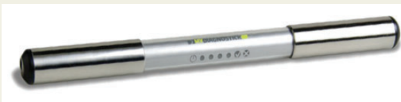
Figure 1 The MyDiagnostick device.

The MyDiagnostick ( www.mydiagnostick.com , MyDiagnostick Medical BV) is intended to discriminate AF from a normal cardiac rhythm (normal sinus rhythm, NSR) based on the ECG. This is achieved by an easy accessible device that can be used by both care providers like general practitioners, nurses, cardiologists and patients. The device has the shape of a stick (length 26 cm, diameter 2 cm) with metallic electrodes at both ends as shown in Figure 1 . The MyDiagnostick does not depend on any infrastructure or communication channels and can be used anytime, anywhere by simply holding the device in both hands for 60 s until the result is revealed. While holding the device, it will flash on the rhythm of the detected heartbeat. After 1 min, the MyDiagnostick either turns green, indicating a normal cardiac rhythm, or red in the case of AF. The MyDiagnostick has no buttons to select functions and switches automatically on when holding the device and will switch off after it has revealed the diagnostic result (red or green light) to the user. Due to the intuitive nature of the MyDiagnostick, diagnosis for AF can be